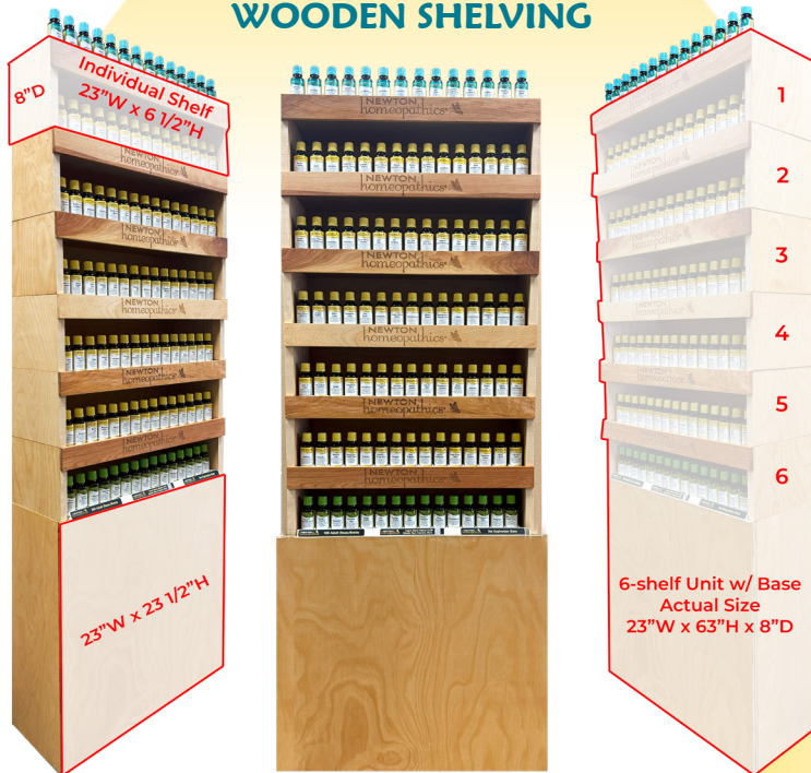
Photo displays 6 stackable shelves atop optional base. Base and individual shelves are sold separately. $75.00 Each

Each shelf holds 15 SKU, max. 6 deep. Use the base or stack shelves on your current shelving. A minimum of 60 SKU must be carried to qualify for a FREE display.